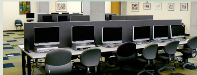
David Kirk Media Center