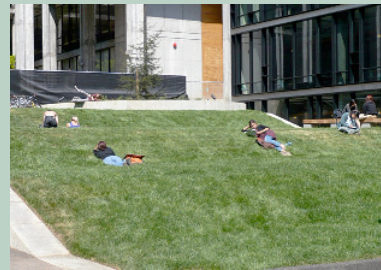
Mary Ackerknecht Reading Garden

And we thank you from the bottom of our hearts.