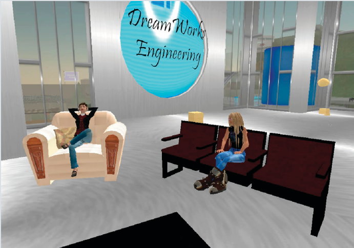
HVX and Mica collaborating on the LAUC-B conference presentation Projects created by UC Faculty

Ultimately what we find will influence future changes in how we use the main floor of the S&E library. What are the benefits of using a virtual space in such a way? Many of us who work in the building have ideas on better ways to utilize the space. By creating a virtual main floor we can see if those ideas are feasible. We get to try out new services and configurations in a cost effective way, to walk in our students' shoes, and to determine what does and does not work, before the project would continue forward in real life.