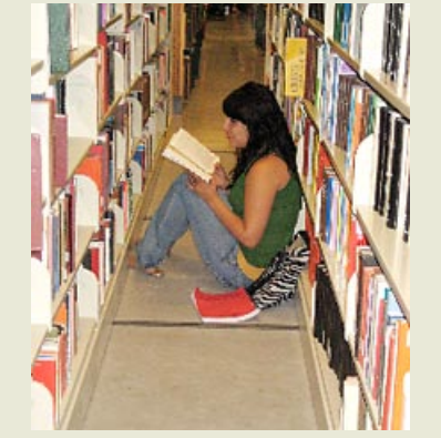
Each student's idea of comfort is her own.

McHenry Library Summer Quarter Hours June 22, 2009 - September 23, 2009